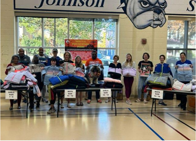
FIREFIGHTERS AND FRIENDS 18<sup>TH</sup> ANNUAL COAT GIVEAWAY