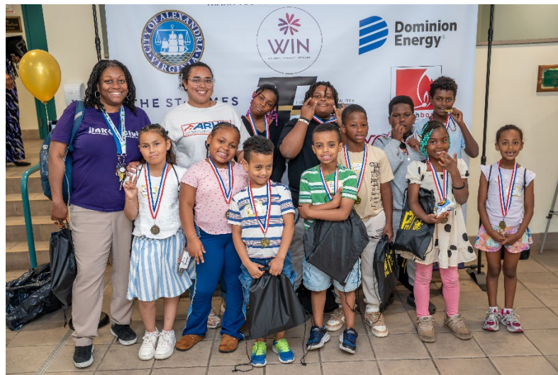
5 TH ANNUAL COMMUNITY SPELLING BEE