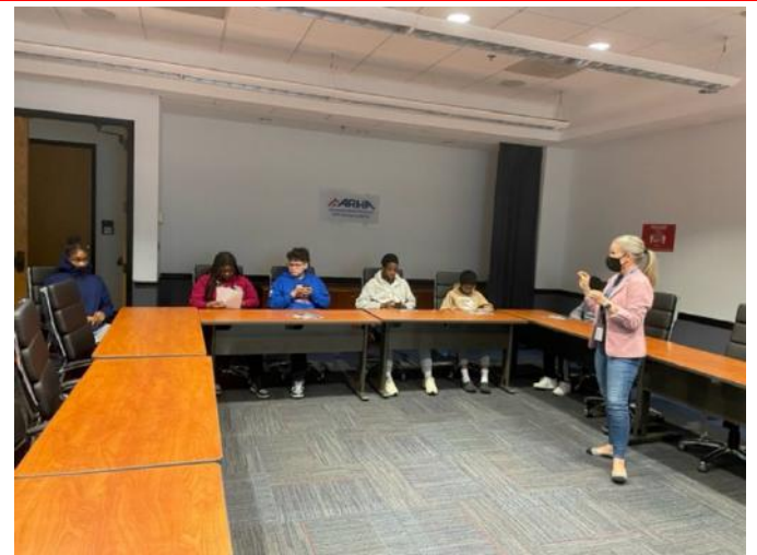
SUMMER YOUTH EMPLOYMENT PROGRAM APPLICATION SESSION