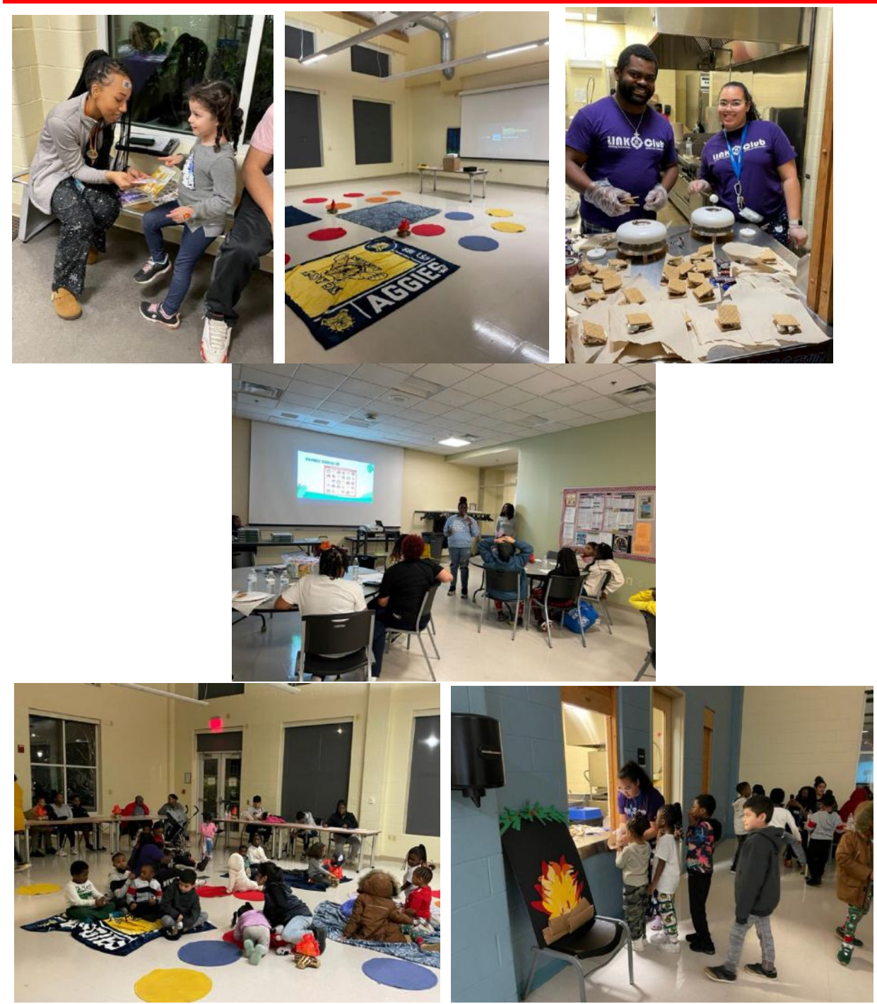
READING BY THE CAMPFIRE - THE LIFE OF A SMORE