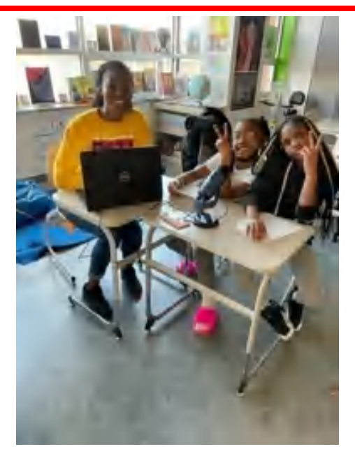
LINK STUDENTS LEARNING HOW TO CREATE A PODCAST