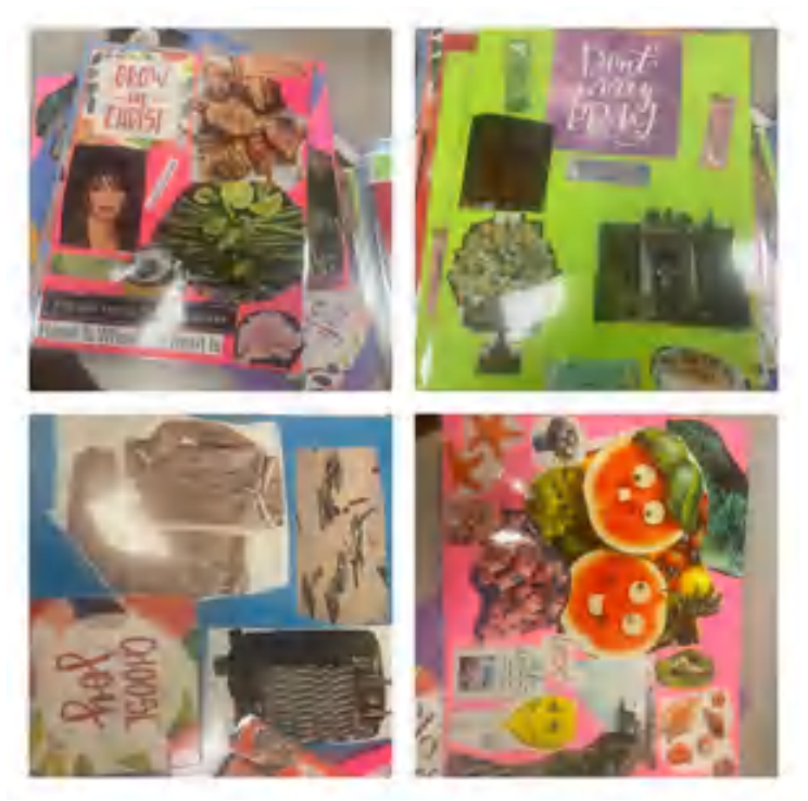
SENIOR CENTER AT CHARLES HOUSTON FITNESS AND NUTRITION VISION BOARDS