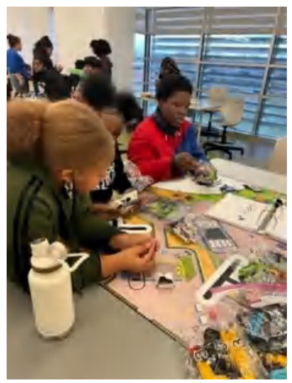
LINK STUDENTS PARTICIPATING IN ENGINEERING & STEM ACTIVITIES