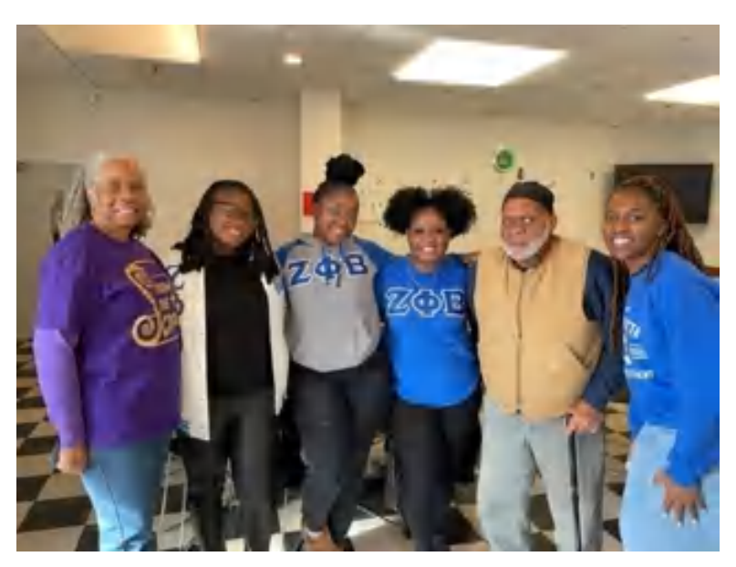
MEMBERS OF SHILOH BAPTIST CHURCH & ZETA PHI BETA SORORITY WITH SENIORS