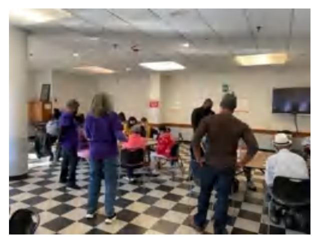
LADREY SENIORS PARTICIPATING IN COGNITIVE GAMES ON MLK DAY OF SERVICE