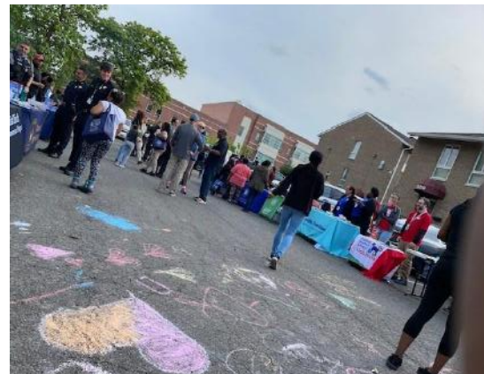
COMMUNITY COOKOUTS AT HOPKINS-TANCIL/RUBY TUKER AND PRINCESS SQUARE