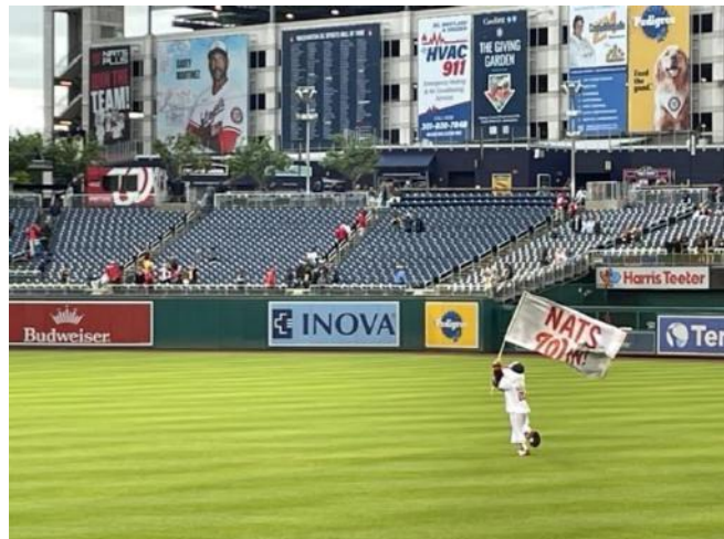
WASHINGTON NATIONALS BASEBALL GAME