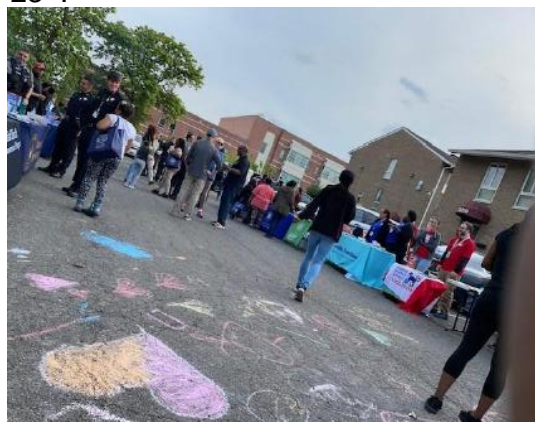
COMMUNITY COOK OUTS AT HOPKINS-TANCIL AND PRINCESS SQUARE