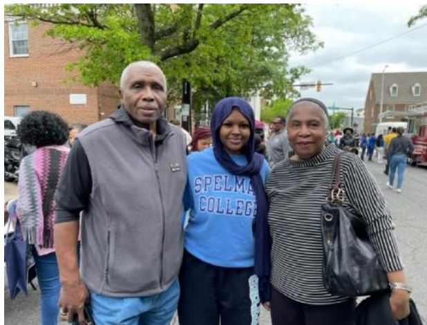
ALEXANDRIA BLACK FAMILY REUNION @ BARRETT LIBRARY