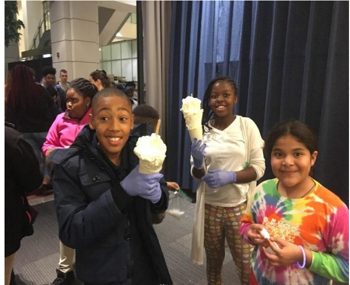
NOCHE DE CIENCIAS EVENT SPONSORED BY ACPS FACE PROGRAM & USPTO