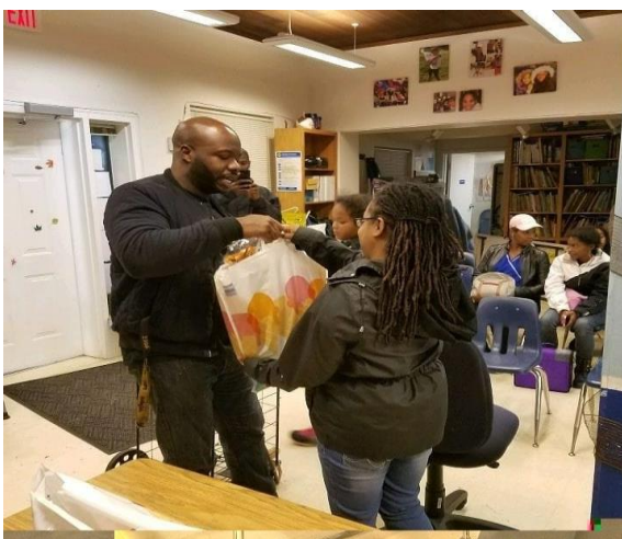
RESIDENT RECEIVING THANKSGIVING BASKET