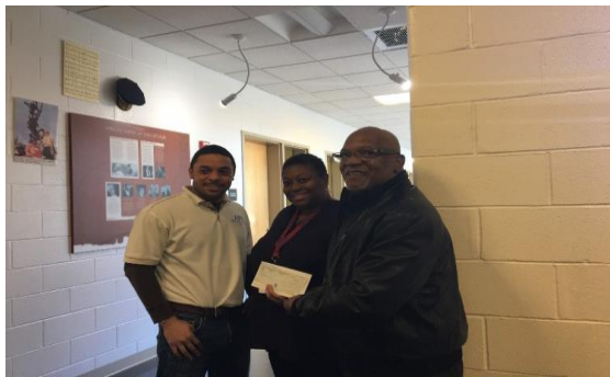
ALEXANDRIA PEST SERVICES, INC

The National Organization of Black Law Enforcement Executives (NOBLE), the Department of Recreation, Parks, and Cultural Activities, the Alexandria Police Department, and the Departmental Progressive Club (DPC), recently sponsored a presentation entitled “The Law & Your Community”. RACS Staff worked with the Recreation Department to identify young people to attend and helped provide transportation to the event. The discussion was aimed at middle and high school students, along with their parents, and allowed an opportunity for young people to communicate with Law Enforcement Officials. This timely and informative conversation provided a forum for attendees to not only ask questions, but also participate in live simulations of different types of “stops” and learn the proper ways to interact and respond to Officers during those occurrences. Attendees were equipped with vital life skills and information, that we hope will ultimately help them and law enforcement officers achieve a common goal of getting home safely.