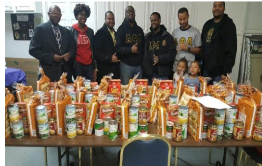
FIRST AGAPE CHURCH & ALPHA PHI ALPHA BASKET DONATION