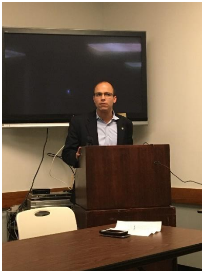
MAYOR ELECT JUSTIN WILSON