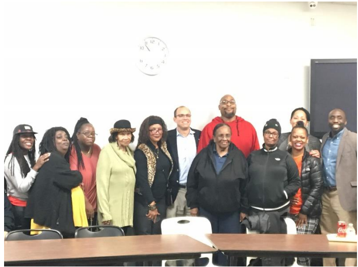
ARA & LADREY ADVISORY BOARD WITH MAYOR ELECT