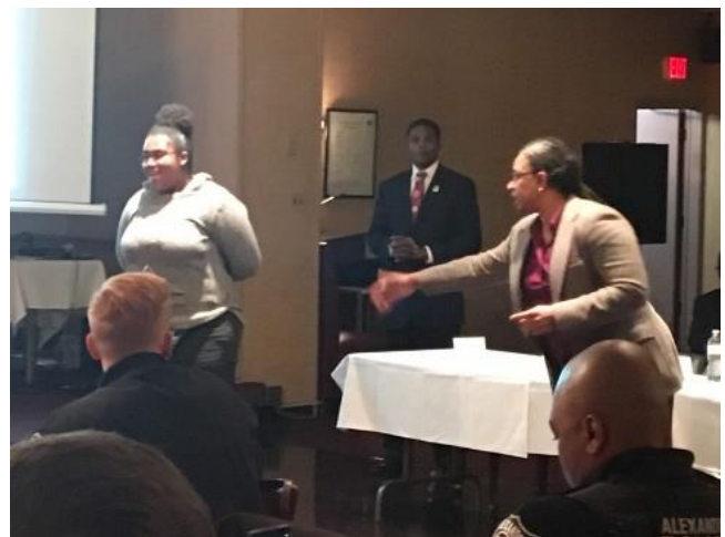
ARHA STUDENT ASSISTING WITH DEMONSTRATION