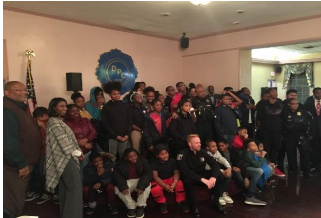
THE LAW & YOUR COMMUNITY SESSION @ DEPARTMENTAL PROGRESSIVE CLUB